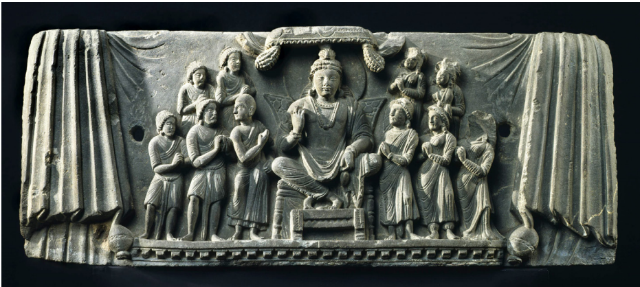
Fig. 4. Pedestal of a missing statue comprising a large family group of donors, unknown provenance © Staatliche Museen zu Berlin, Museum für Asiatische Kunst, Berlin. CC BY-SA 4.0.

Overall, the reliefs follow a repetitive presentation structure with figures executing similar actions towards the central zone. The figures are generic; meaning their physiognomy is not varied within the composition ( Fig. 4 ). Their clothing can only be described as Indic comprising of an uttariya and parīdhāna (upper and lower body garments respectively), with the exception of a handful of pedestals depicting groups of figures in Kuṣāṇa attire (wearing a tunic and trousers). 42 The abstract facial character of the figures suggests that they are not portraits in the western sense but may be visual types that identify them as specific types of donors and devotees. When there are differences between the figures, even subtle, we can ascertain information that is not provided by our textual sources. 43