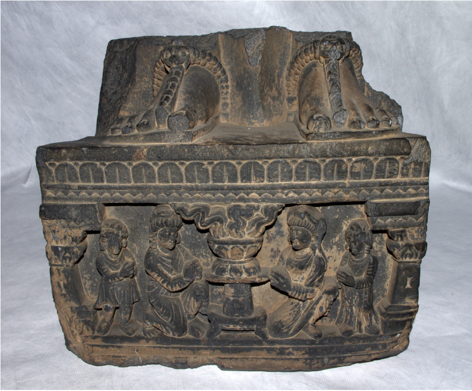
Fig. 13. Pedestal relief depicting an open incense burner, unknown provenance The CC BY-NC-ND 4.0 licence does not apply to this picture.

jambuchhāyā (the shade of the jambu tree) was installed in the Dharmadeva vihāra (the name of the monastery) by Madurikā, daughter of Khara, sometime in 255 CE (WILLIS 1999–2000). It is hard to imagine the statue being paraded, needless to say that stone images are significantly heavier than bronze statues that were typically used for processions in the later periods. Nevertheless, the Sanchi statue along with the inscription attest to the persistence of the image type “Bodhisattva Sitting in the Shade of the Jambu Tree” in the Kuṣāṇa period. Even when stationary within a niche or a chapel, the statue was likely the focus of ritual activities in the manner echoed by our Gandhāran pedestals.