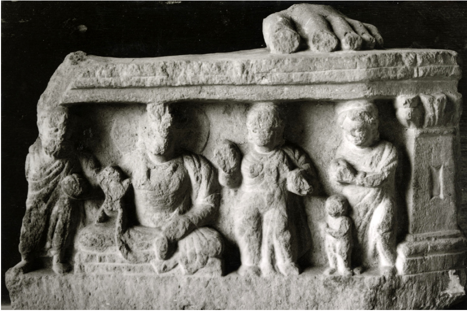
Fig. 8. Pedestal of a missing statue comprising adult and child donors, unknown provenance