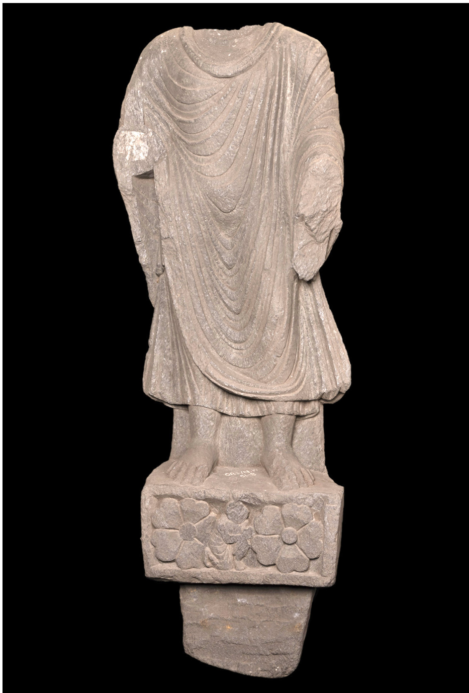
Fig. 16. Statue of standing Buddha with pedestal comprising one monastic donor, Indian Museum, India © Indian Museum, Kolkata. The CC BY-NC-ND 4.0 licence does not apply to this picture.