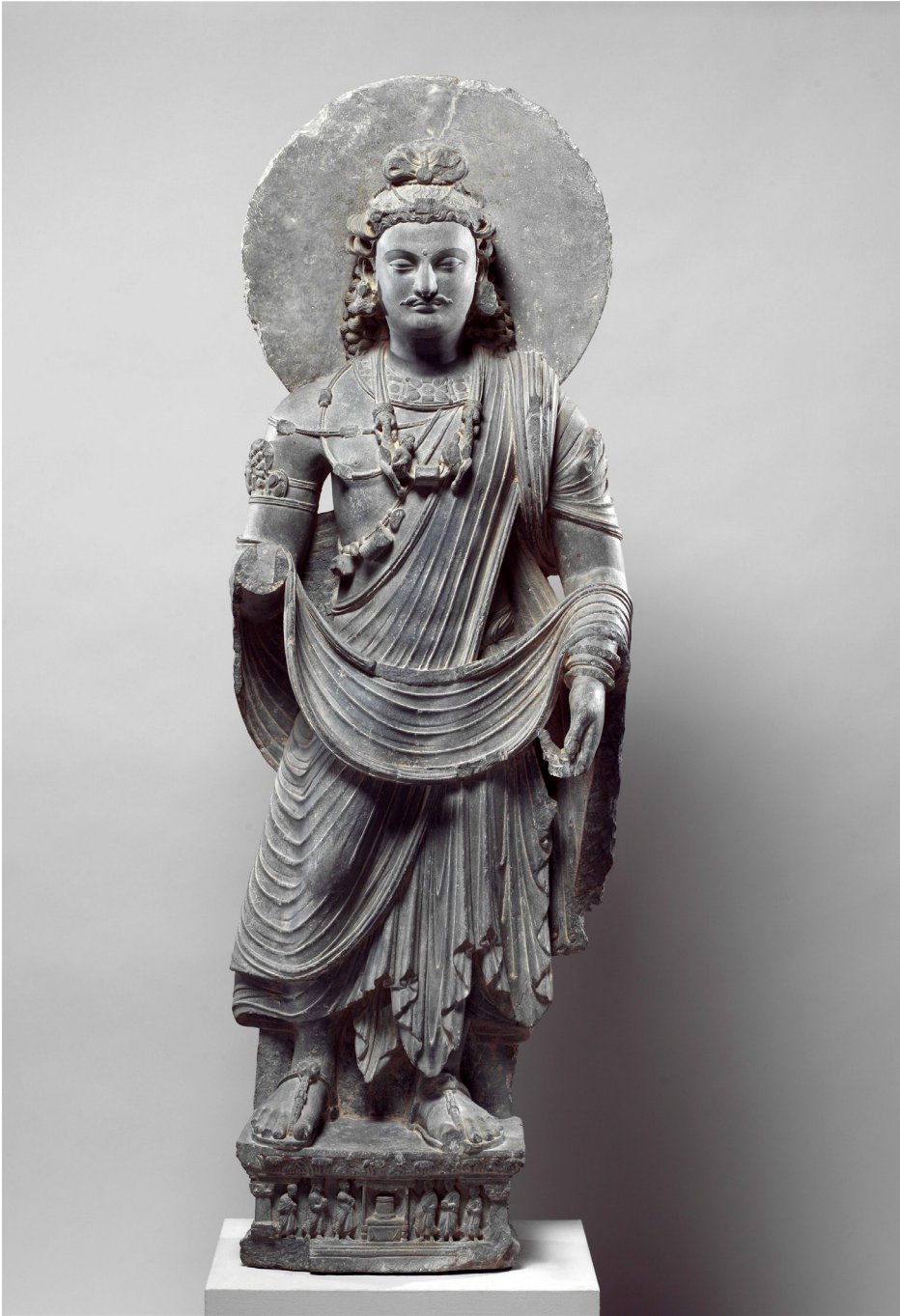
Fig. 5. Statue of standing Bodhisattva with pedestal comprising six donors, unknown provenance, The Metropolitan Museum of Art, USA © The Metropolitan Museum of Art. CC0 1.0 Public Domain.