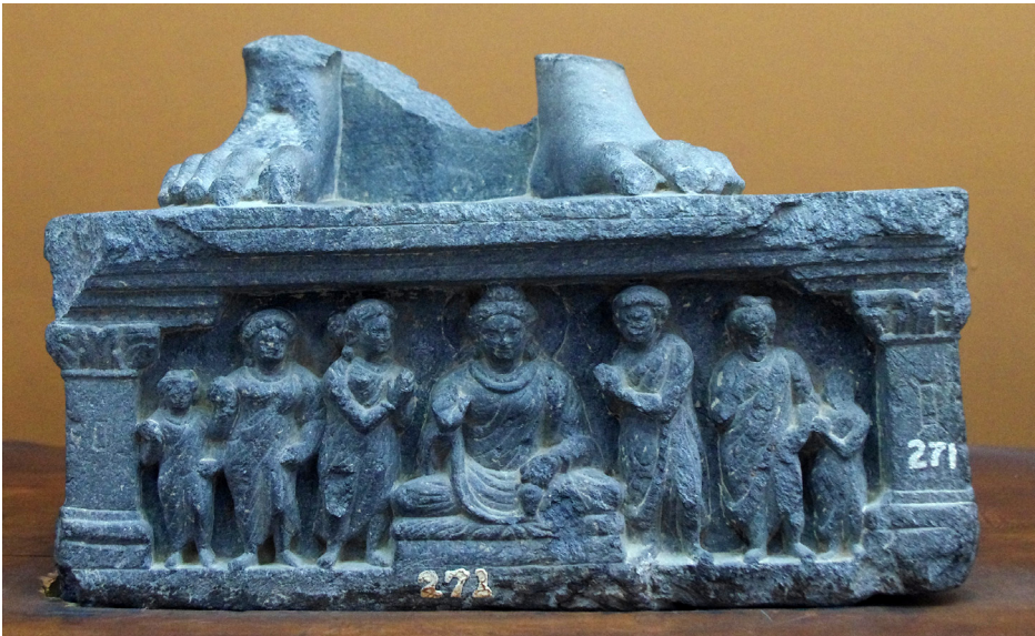
Fig. 9. Pedestal of a missing statue comprising adult and child donors, unknown provenance © Chandigarh Government Museum and Art Gallery, A. Lakshminarayanan. The CC BY-NC-ND 4.0 licence does not apply to this picture.