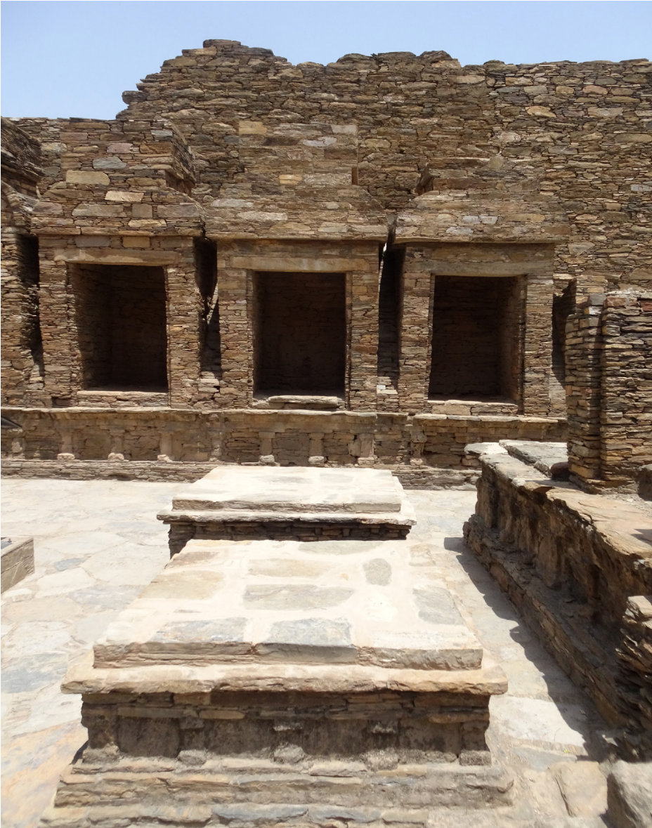
Fig. 3. Shrines surrounding the main stūpa , Takht-i-Bahi, Pakistan © A. Martin. The CC BY-NC-ND 4.0 licence does not apply to this picture.

style, are plain and undecorated. 41 For this reason, we can safely advance that