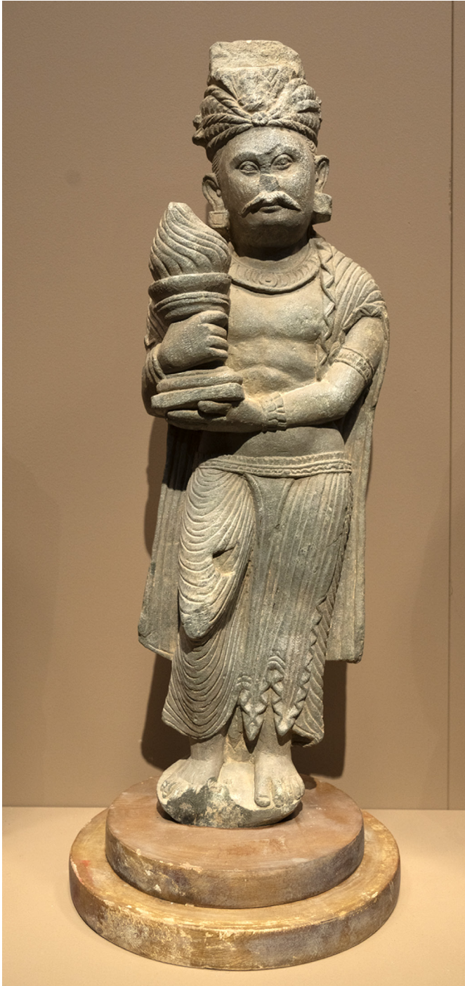
Fig. 15. Statue of a standing male figure carrying a fire burner, Butkara I, Pakistan © Z. Zhong. The CC BY-NC-ND 4.0 licence does not apply to this picture.