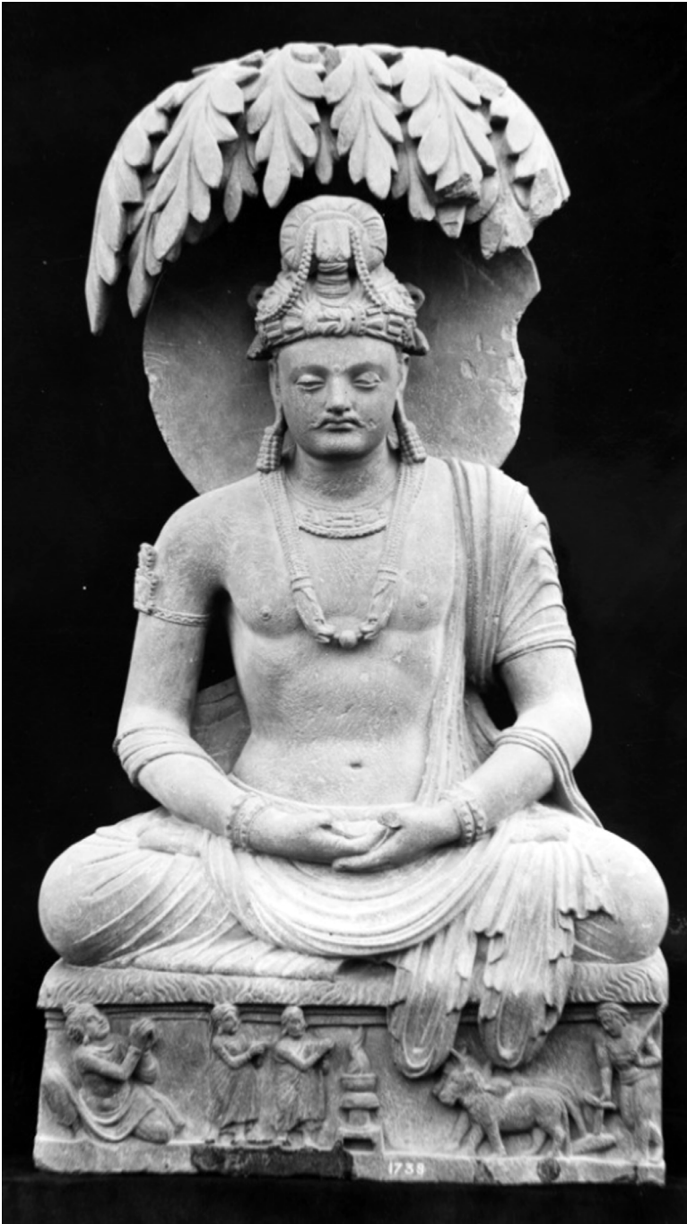
Fig. 11. Seated Siddhārtha in meditation, Lahore Museum, Pakistan © The Warburg Institute Iconographic Database. The CC BY-NC-ND 4.0 licence does not apply to this picture.