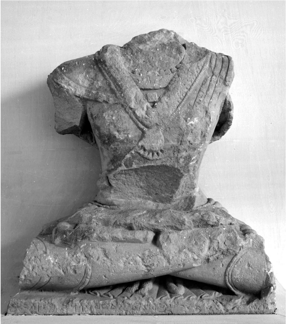
Fig. 12. Seated Bodhisattva in meditation, Sanchi, India © American Institute of Indian Studies. The CC BY-NC-ND 4.0 licence does not apply to this picture.

procession. With much pomp and circumstance, the image was successful in obtaining an abundance of donations, including flowers and cloth (SCHOPEN 2014: 306–309). Art historical and epigraphic evidence suggest that donating Bodhisattva images was common in the Kuṣāṇa period, both Gandhāra and Mathura. 54 Notably, the inscription on the pedestal of a seated Bodhisattva statue from Sanchi states that a shrine ( grha ) was made for the image of the Bodhisattva under the Jambu -shade ( Fig. 12 ). The shrine for the statue of the type