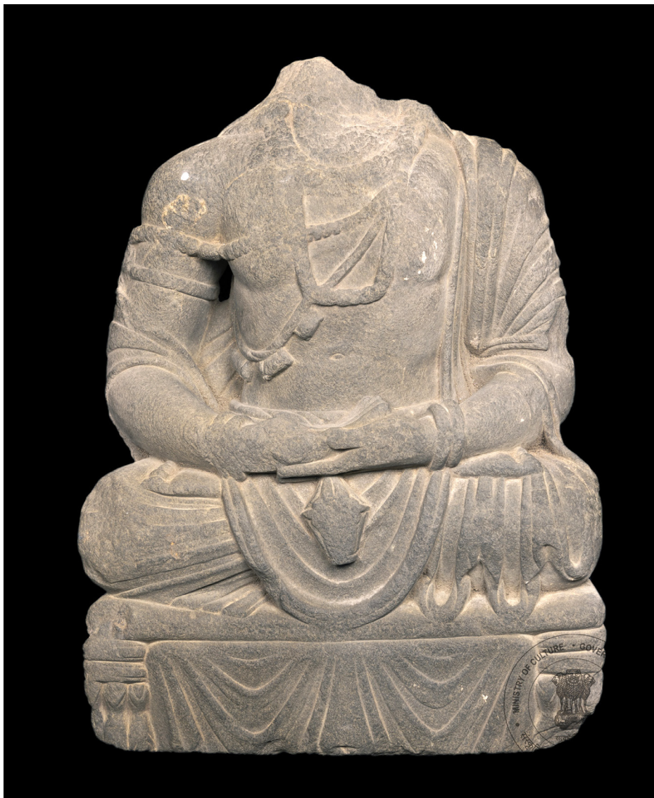
Fig. 2. Statue of seated Bodhisattva Maitreya with a decorated pedestal, Indian Museum, India © Indian Museum, Kolkata. The CC BY-NC-ND 4.0 licence does not apply to this picture.

to a broad period falling between the second and the fourth centuries CE. This chronological period is substantiated on the results from excavations recording early examples of Buddhist art in the Swat Valley. The early artistic evidence from Swat Valley sites, such as Butkara I, Saidu Sharif I and Panr I, do not consist of statues with decorated pedestals. Whenever preserved, the pedestals of statues in the earliest dated Gandhāran artistic style, also known as drawing