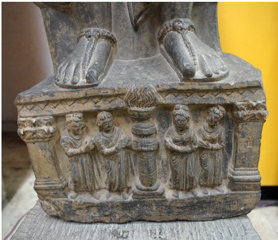
Fig. 14. Detail of a pedestal depicting an open fire burner, unknown provenance © Chandigarh Government Museum and Art Gallery, A. Lakshminarayanan. The CC BY-NC-ND 4.0 licence does not apply to this picture.

which were celebrated such as the First Meditation. In the presence of these auspicious events, donor figures perform various activities, namely offering garlands, flowers and clothing and using contemporary accoutrements, namely incense burners ( Fig. 13 ) and fire stands ( Fig. 14 ). When incense burners and fire stands appear on pedestals, it is not hard to imagine that statues may have been venerated similarly with these objects. 55 They are generally placed on the ground as donor figures symmetrically stand around them in various attitudes. The use of these accoutrements could also be dynamic, for instance, pedestals depict figures holding the incense burner and fire stand in their hands, 56 or