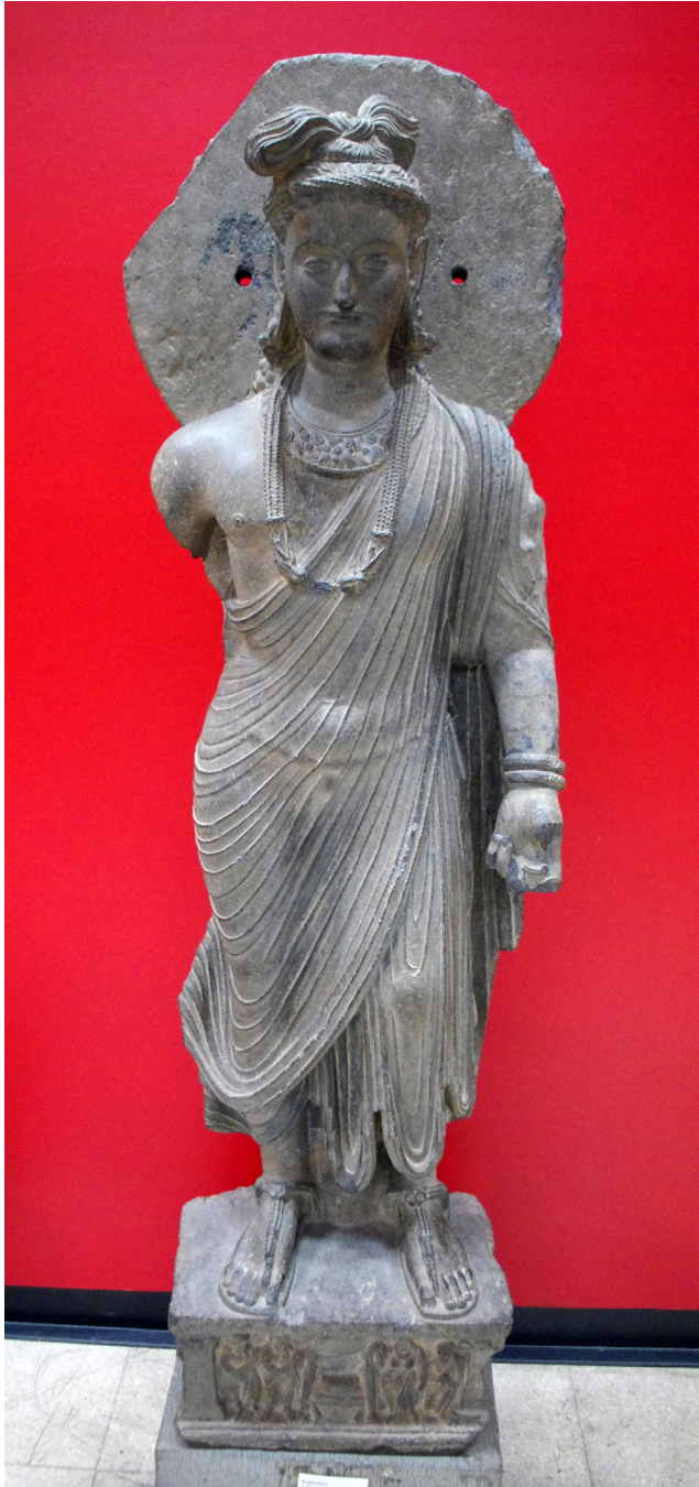
Fig. 6. Statue of standing Bodhisattva with pedestal comprising four donors, Sikrai, Pakistan The CC BY-NC-ND 4.0 licence does not apply to this picture.