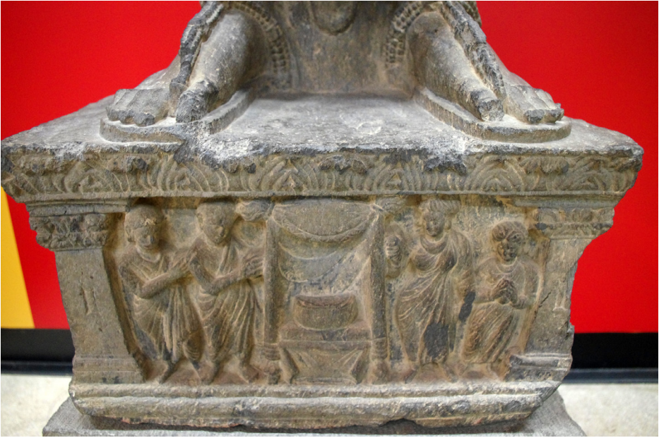
Fig. 7. Detail of pedestal in Fig. 6, Sikrai, Pakistan, Chandigarh Government Museum and Art Gallery, India © Chandigarh Government Museum and Art Gallery, A. Lakshminarayanan. The CC BY-NC-ND 4.0 licence does not apply to this picture.

As with the previous illustration, the figures are not always depicted in equal size on the pedestals. In some cases, the size of the figures is impacted by the architectural frame. For example, on Fig. 5, the figures are of varying scale. However, the size of the last figures on either side of the reliquary is clearly impacted by the elongated cornice emerging above the Gandhāran-Corinthian pilasters. In contrast, we can identify pedestal images in which scale was deliberately manipulated to convey internal relationships between figures. In the case of the partially damaged pedestal currently at the Staatliche Museen zu Berlin, there are four figures venerating a seated Bodhisattva ( Fig. 8 ). To the right of the Bodhisattva are three figures, two female figures in Indic attire and one small figure standing between them, a child. 47 The presence of a child amongst donor groups is significant. The two figures closest to the Bodhisattva hold offerings in their hand, the child and the second female figure venerate in añjalimudrā . Similarly, a pedestal of unknown provenance from the Government Museum and Art Gallery, Chandigarh depicts a group of lay men and women venerating the seated Buddha in abhayamudrā ( Fig. 9 ). On either side of the Buddha are three female figures and three male figures of whom the last figures