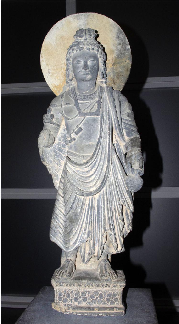
Fig. 1. Statue of standing Bodhisattva Maitreya with a decorated pedestal, Musée national des Arts asiatiques – Guimet, France The CC BY-NC-ND 4.0 licence does not apply to this picture.